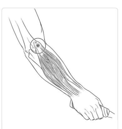
Location of pain in lateral epicondylitis.

The symptoms are often worsened with forearm activity, such as holding a racquet, turning a wrench, or shaking hands. Your dominant arm is most often affected; however both arms can be affected.