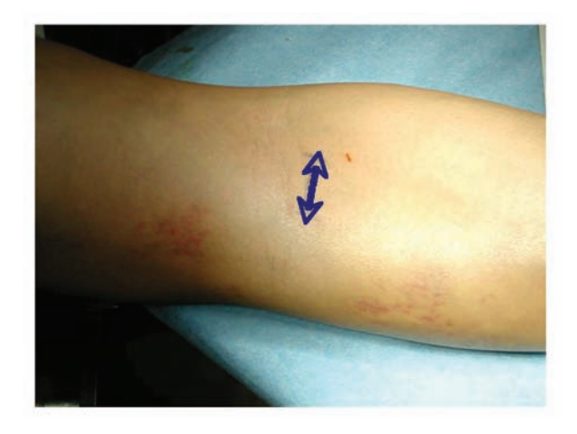
Figure 1. Short anterior incision in the safe area.