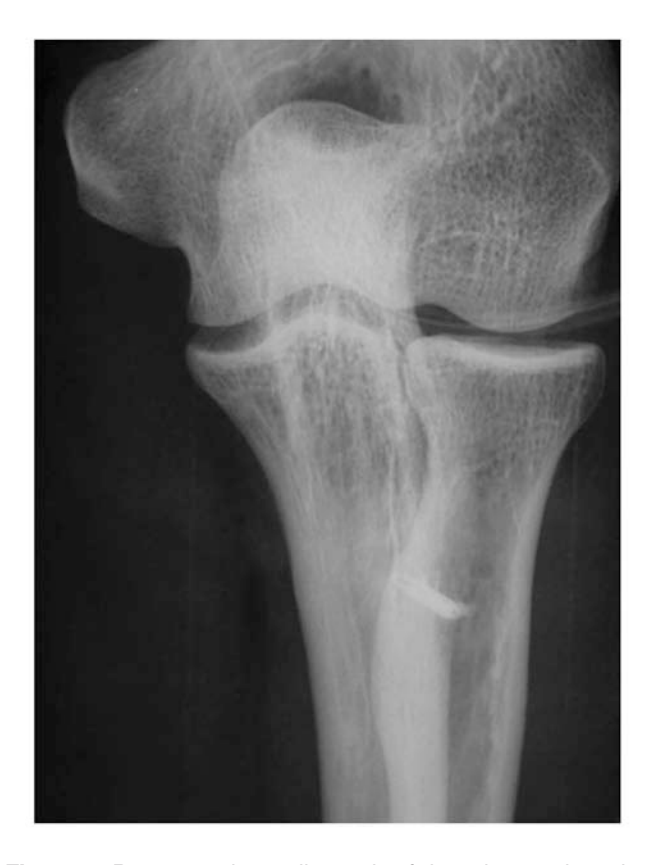
Figure 5. Postoperative radiograph of the reinserted tendon with metal suture anchor on the radial bicipital tuberosity.

physiotherapy with residual lack of motion (Table 1, patient no. 5). This patient had had anterior interosseous nerve syndrome 2 years previously, which spontaneously recovered in 4 months. At further follow-up, 2 patients were noted to have ectopic ossifications but without any clinical consequences.